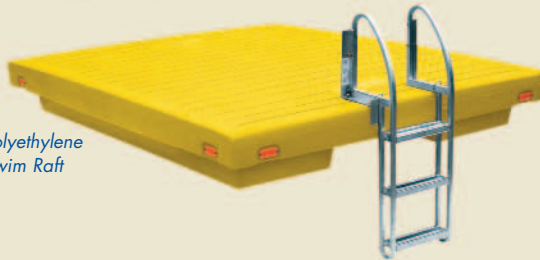
Polyethylene Swim Raft