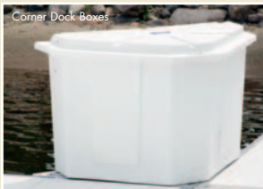
Corner Dock Boxes

Great ways to make your dock more useful and fun.