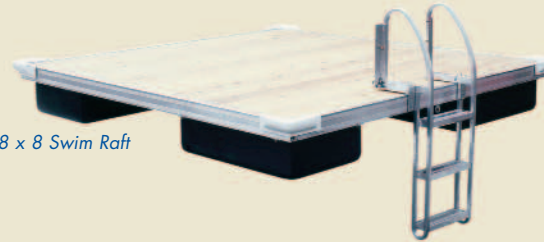
8 x 8 Swim Raft